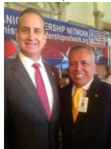
Hon. Mario Diaz-Balart