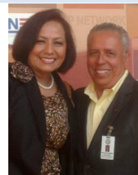
Rosario Marin Former U.S Treasurer