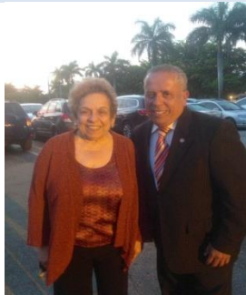
Donna Shalala, President of UM