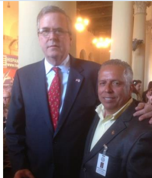
Former U.S. Treasurer Rosario Marin Past Puerto Rico Governor Luis Fortuno