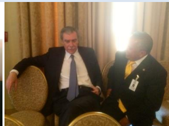
A private conversation U.S Secretary of Commerce